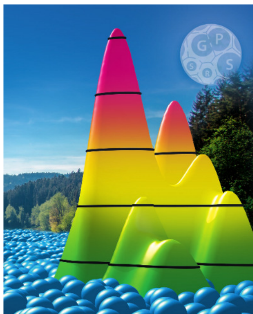
FIG. 1. This box demonstrates the inclusion of figures. Note that in the \includegraphics command, the file name should be given just as the base name, without a .eps , .pdf , .png , or .jpg ending. Make sure that your figure file names have these suffixes in lower-case letters and contain no space characters.